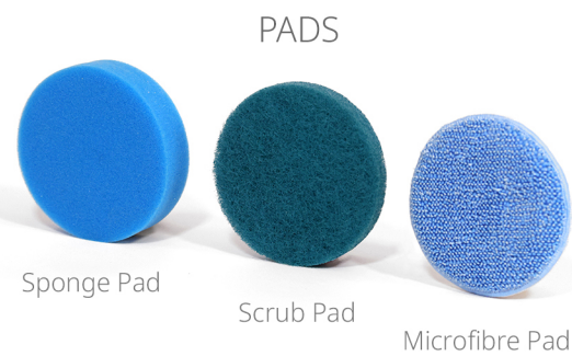
PADS Sponge Pad Scrub Pad Microfibre Pad