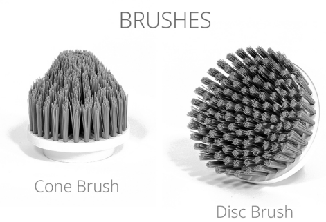
BRUSHES Cone Brush Disc Brush

CASE Practical case for quick, clean storage incl. charging cable