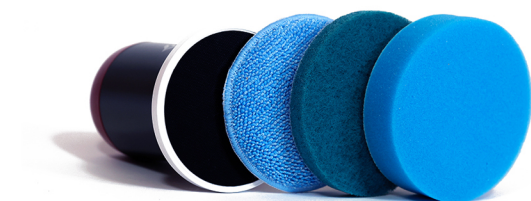
VELCRO PAD WITH 3 PADS